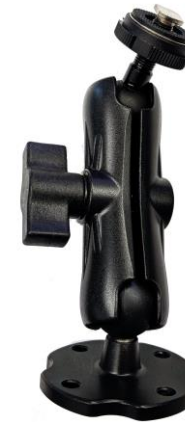
Includes our ADD25F Heavy Duty Mount

20m – 65 ft. female to male camera cable part# CB020